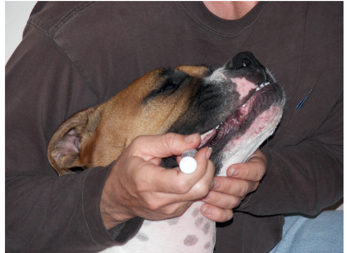
Oral syringe (in right hand) is slipped into the cheek pouch at the corner of the dog’s lips, while the head is held slightly elevated (left hand).